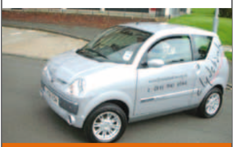
Roadshows will be arranged soon. Details to follow.

'Then why not hire an eCar!' At only £5 a day, it's perfect for journeys of up to 35 miles.