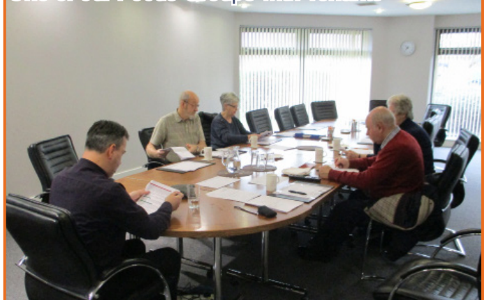
One of our Focus Groups with Tenants

https://www.clydebank-ha.org.uk/get-involved/our-tenant-participation-strategy/