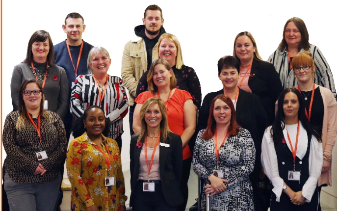
Some of our dedicated staff team

Today our aim to provide good quality, affordable