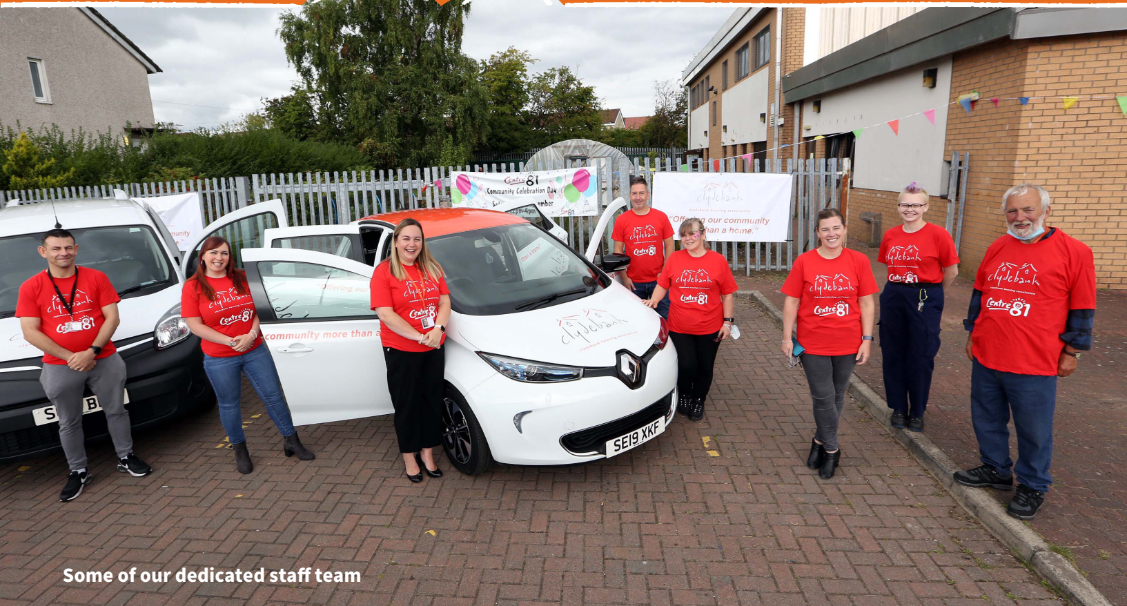
Some of our dedicated staff team

“Offering our community more than a home”